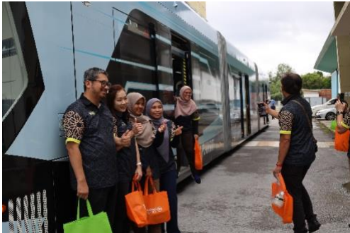
Delegates of INTAP taking photos after their ride on the prototype ART vehicle