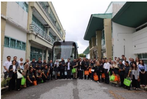
The delegation from INTAP in a group photo at KAAF with representatives from Ministry of Transport Sarawak, SFS Office, Sarawak Metro and EMG JV